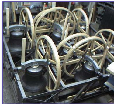
A new "ring" in a metal frame

Because the old wooden frame is of such historic interest, it will be left where it is and access will be provided for anyone wanting to see, or study, it.