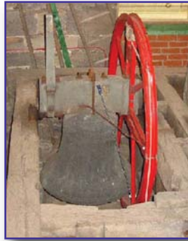
One of the current bells

For many centuries, church bells have rung out over Stone from the tower of St Michael and St Wulfads' church. Six of the bells date back to 1710 and the wooden frame on which they hang is probably much older. Although they are old, the bells were never made to be together as a "ring" and are now, because of wear, needing to be replaced.