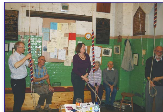
Some of the Stone Ringers at their regular Thursday practise