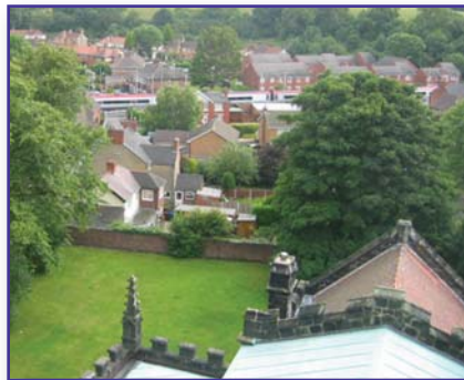
View over Stone from the bell tower

The bells traditionally call churchgoers to prayer and ring out at other joyful times, such as weddings. They make every occasion even more special.